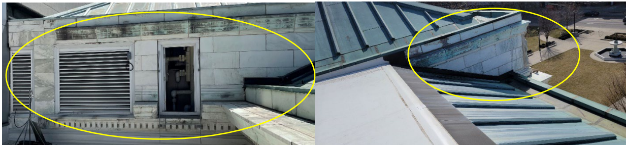
Mortar joints on the northern facing vertical marble panel faces

Use US Heritage Group Heritage Lime Putty Mortar – Type O to repoint the mortar joints.