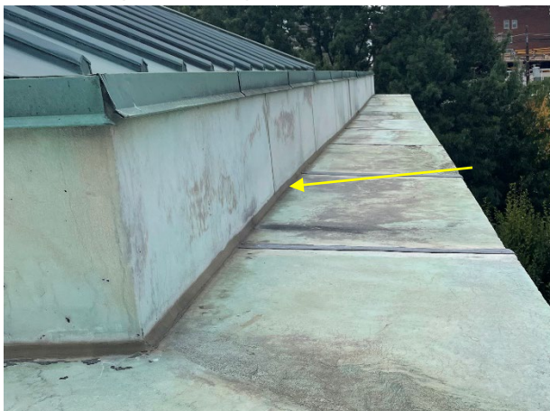
Horizontal joints along the cornice capstone ledges