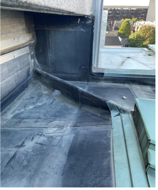
East wall northeast corner looking east