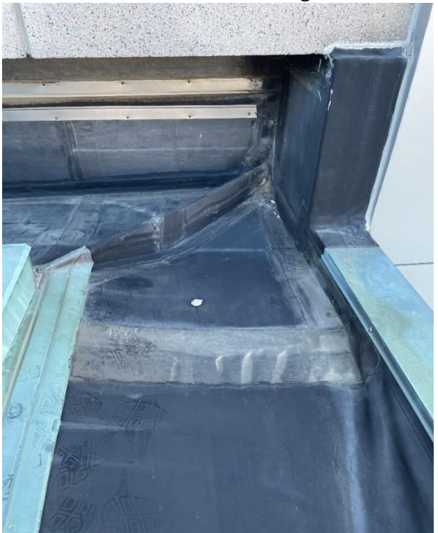
East wall northeast corner looking north