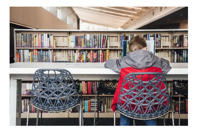
CML's spaces are designed to be inviting, showcase the collection and spur curiosity for customers of all ages.